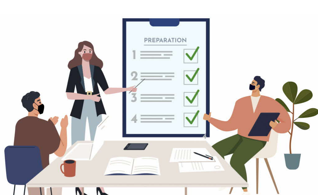
Table-top exercises can help your colleagues better understand the various emergency scenarios and what they should do. This includes responses against terror attacks e.g. Run, Hide, Tell . It also enables your company to finetune the emergency response plan and identify gaps in contingency plans for various scenarios.

Learn more on how you can be better prepared by joining our SGSecure@Workplaces Webinar on Mental Wellness: Fostering A Psychologically Resilient Organisation . It will be held on 16 Mar 2022, 2pm, via Zoom — register your interest by emailing us at SGSecure_Workplaces@mom.gov.sg .